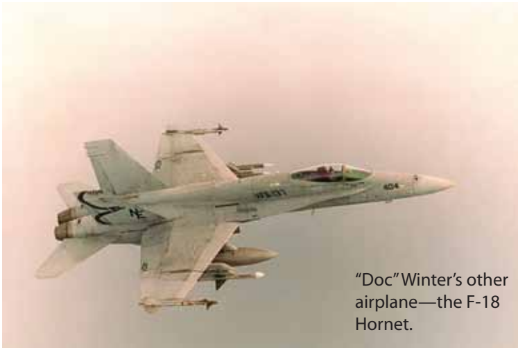
"Doc" Winter's other airplane—the F-18 Hornet.