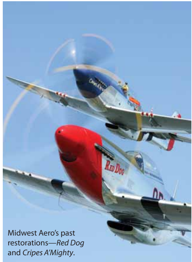
Midwest Aero's past restorations— Red Dog and Cripes A'Mighty .

“Aside from the fighting part of the Mustang, it is truly a delight to fly. It responds beautifully and is a predictable fighter to fly. It is very harmonious in its controls, and the visibility is unbelievable. The controls seem to be situated as if placed there by a fighter pilot. Everything is in its proper place and is easily accessible. To me the P-51 Mustang is the